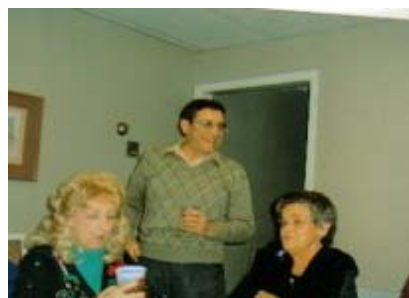
What did they put in this drink?