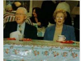
The Godfather and Wife.

An old man was sitting on a bench in the park. A young man walked up to the bench and sat down next to him. He had spiked hair in all different colors: green, red, orange, blue and yellow. The old man just stared. Every time the young man looked, the old man was starring. The young man finally said sarcastically. "What the matter old timer, never done anything wild in your life?" Without batting an eye, the old man replied. "Got drunk once and had sex with a peacock. I was just wondering if you was my son."