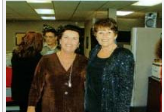
Queens of the Ball!

Study these last five lessons as they will come handy when we start to put sentences together.