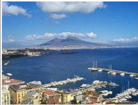
Skyline of Comune di Napoli—See below.

By the time of the introduction of iron into Italy (c.1000 BC), regional variations were well established.